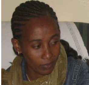
“YESSERA has given us the fishing hook and has taught us how to fish. Now it is up to us to fish.”